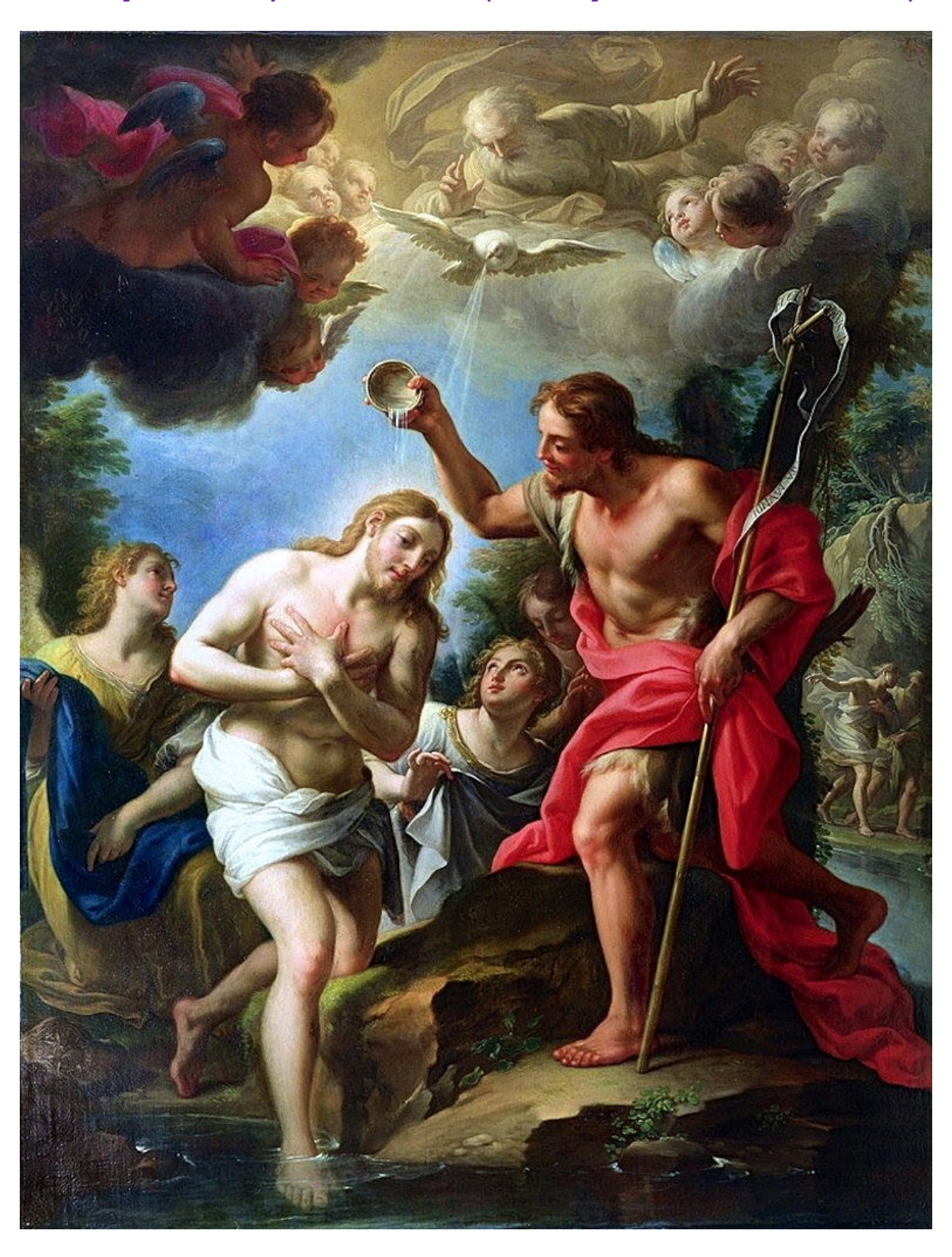
January 8 – The Baptism of the Lord (Final Day of the Christmas season)

"And when Jesus was baptized, he went up immediately from the water, and behold the heavens were opened and he saw the Spirit of God descending like a dove and alighting on him; and behold a voice from Heaven saying, 'This is my beloved Son, with whom I am well pleased." Mt. 3:16-17