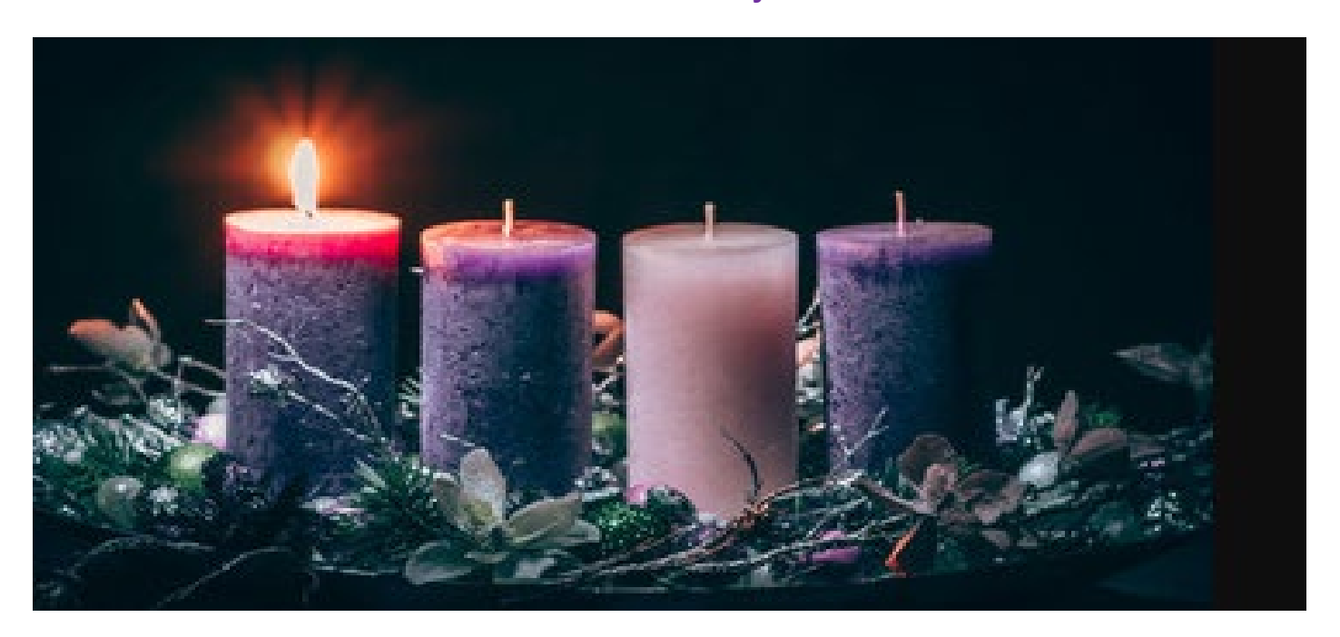
December 3 - 1st Sunday of Advent

Jesus said to his disciples: "Be watchful! Be alert!