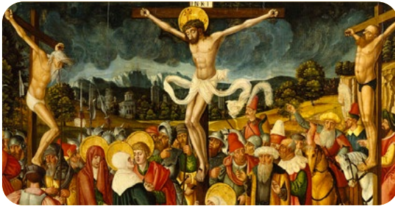
1. Paschal Mystery and the Eucharist

During this Year of Parish Revival, we are encouraging parish priests to implement a series of Sunday homilies to be devoted exclusively to the Eucharist. Eucharistic worship and the implications of this worship are vital for our whole lives. These homilies might cover: