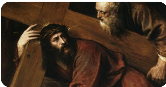
3. Eucharist and the Call to Holiness