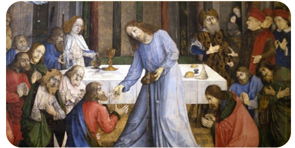
2. Real Presence and Eucharistic Worship